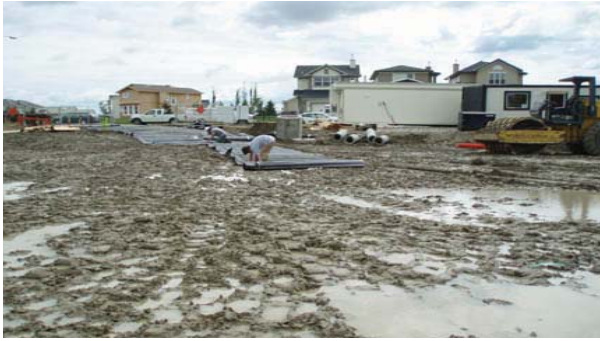
Easy to Deploy

http://www.powerplantsupplyco.com/products.php?prod_id=84