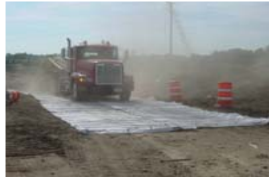
No soft ground delays